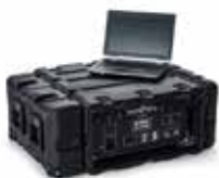
GATE SERIES Remote Networking Systems