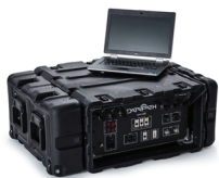
GATE SERIES Remote Networking Systems