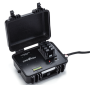
RPM SERIES Portable Power Modules