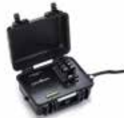
RPM SERIES Portable Power Modules