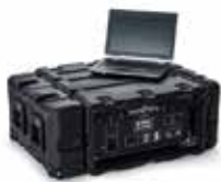
GATE SERIES Remote Networking Systems