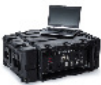
GATE SERIES Remote Networking Systems