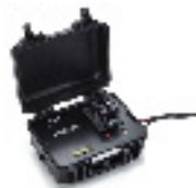
RPM SERIES Portable Power Modules